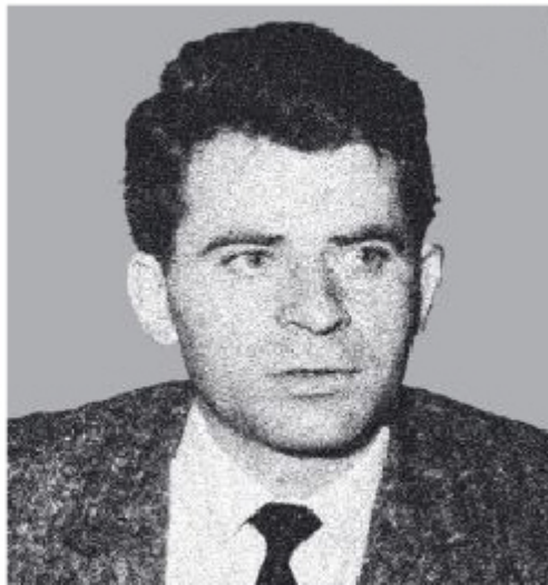
The great Boris