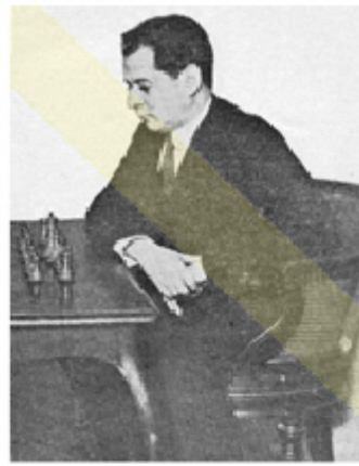
And there was Capablanca