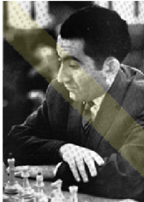
Tigran Petrosian told him