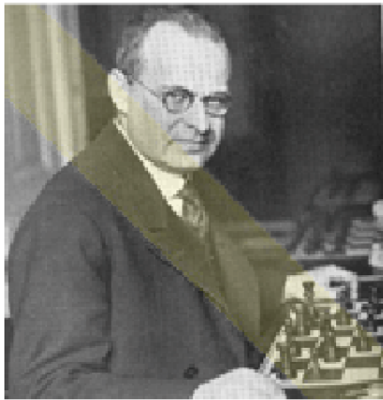
Aron Nimzowitsch told him...