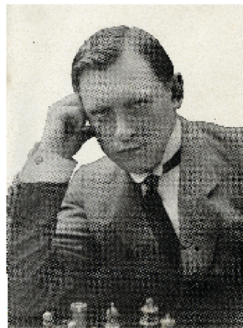
Alekhine “die of a heart attack whilst playing chess like me !”